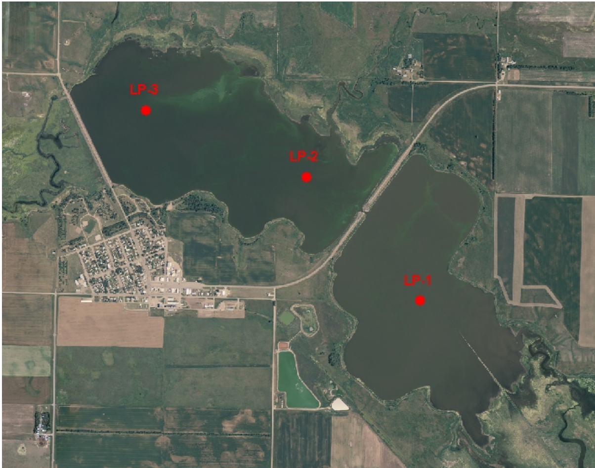
Figure 1: Lake Pocasse Monitoring Sites