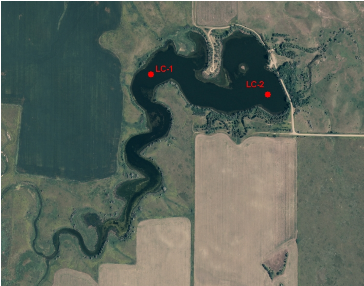
Figure 2: Lake Campbell Monitoring Sites