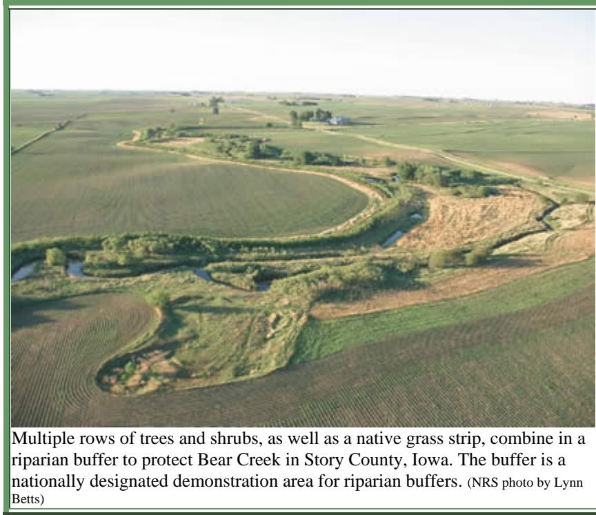
Multiple rows of trees and shrubs, as well as a native grass strip, combine in a riparian buffer to protect Bear Creek in Story County, Iowa. The buffer is a nationally designated demonstration area for riparian buffers.

Two ages of riparian forest buffers were considered as one in the research project. Researchers pointed to an interesting trend after data collection. “The riparian forest buffer that was 9 yr old had significantly less (6%) total eroding bank length compared to the 6 yr old buffer,” they wrote. “This difference suggests that as a riparian forest buffer becomes more established and trees mature, stream bank stabilization increases.”