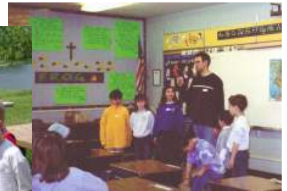
Elementary School Presentations