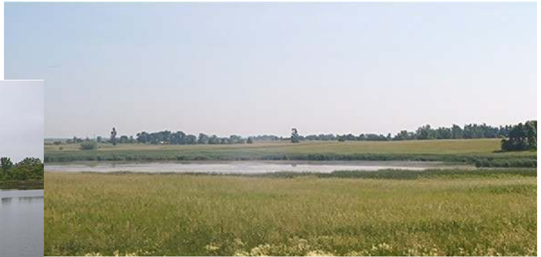
Wetlands at original site location