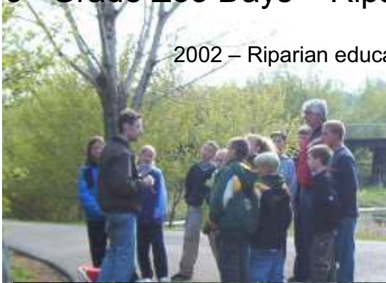
2002 – Riparian education