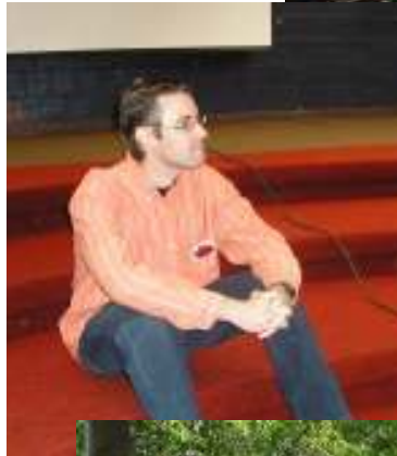
Annual fall Watertown Middle School Social Studies Presentation on formation of the area.