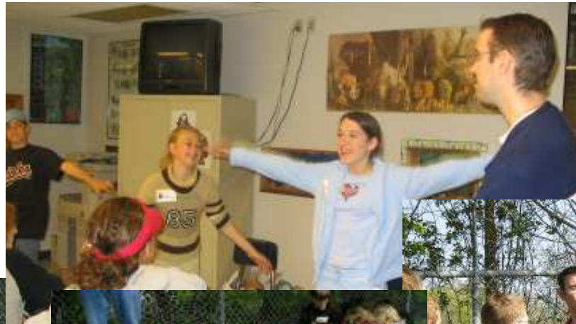
2004 - Riparian