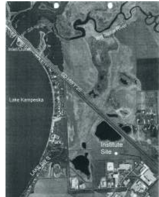
Original site map

Upper Big Sioux River watershed, located in NE South Dakota (on northern tip of the Coteau des Prairies), the 245,400 acre watershed targeted for education activities