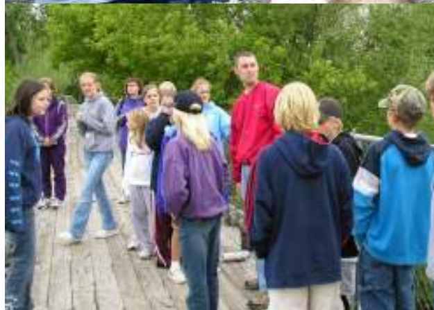
2007 Water Quality