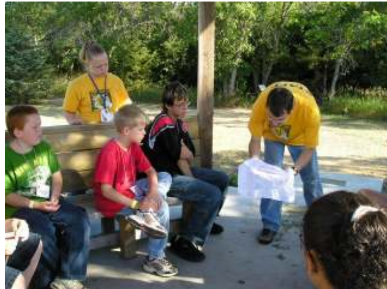
2006 Camp Chance Water presentation