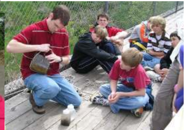
2006 Water testing